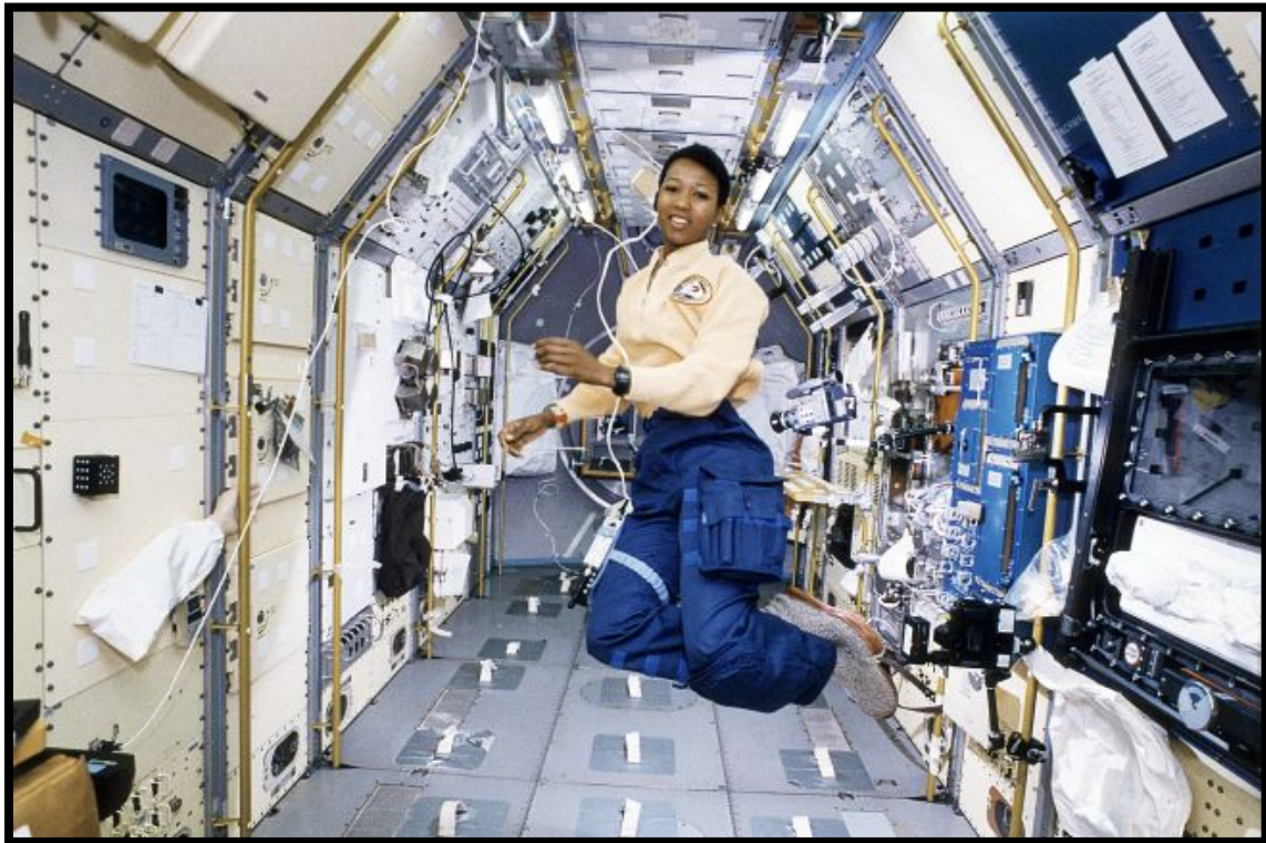
Decatur native Mae Jemison on board the Spacelab.

Objective 4.10.2 Additional: Identifying Alabamians who made contributions in the fields of science, education, the arts, the military, politics, and business during the late nineteenth and early twentieth centuries.