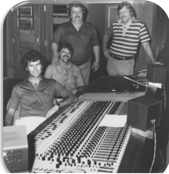
4. These cool guys owned the studio and played the instruments as well. From left to right David Hood (electric bass), Roger Hawkins (drums), Jimmy Johnson (rhythm guitar), and Barry Beckett (keys). Do any of you play an instrument or have one you like? Let us know!