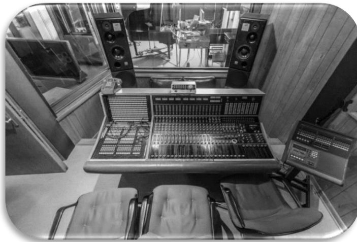
5. A sneak peek behind the control booth. This console used to live in Nashville. If you look on the right-hand side you'll see where the producer set his Coca Cola bottle. Do you see it? Ask your tour guide to point to it if you don't!